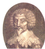
Jean-Louis Nogaret de la Valette First Duke d'Epéron