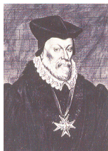
François de Foix Candale