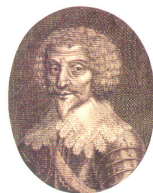
Jean-Louis Nogaret de la Valette First Duke d'Epéron